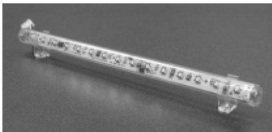
Standard/Advanced LED strip

The AstroFXAurora Standard and Advanced LED lighting systems have become very popular due to the stunningly smooth performance of the